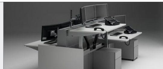
U-Com sit-and-stand desk with Cool-Top